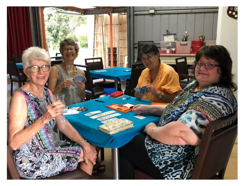
MEMBERS ENJOYING A GLASS OF WINE AT THE SHED

UPCOMING EVENTS: INGHAM CONGRESS: 17-18<sup>th</sup> September