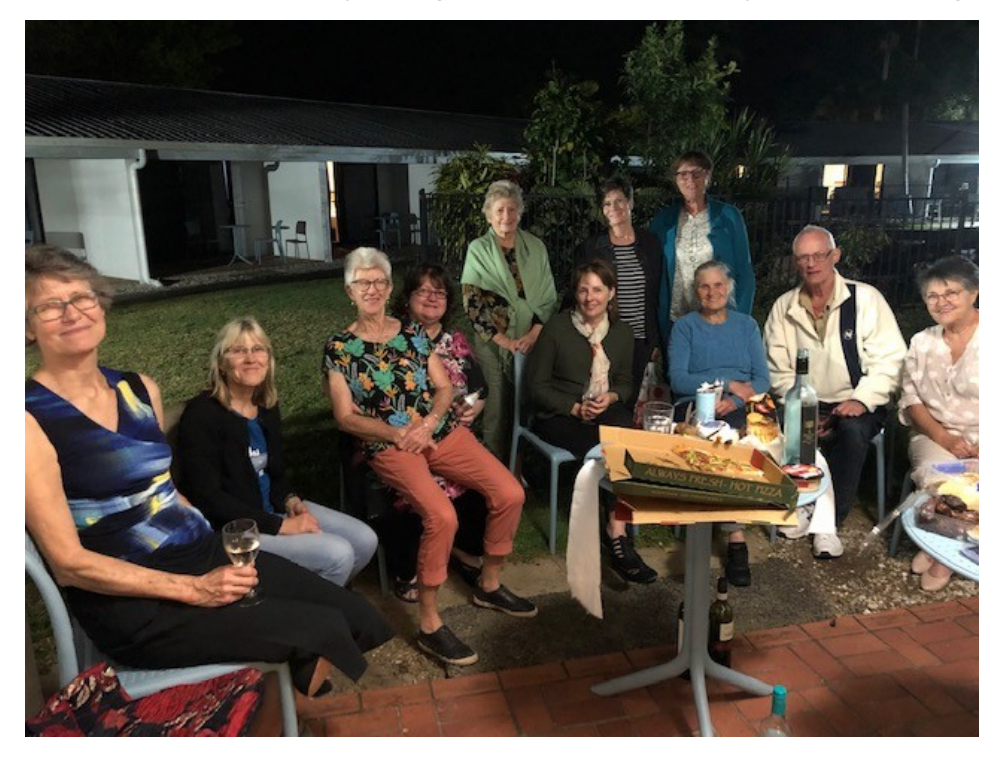
Pizza & Wine after the game, CCC.